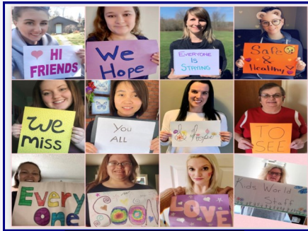
ACW Kids World

As we look back on 2020, we can only describe it as an unprecedented year. A Child's World's Educators, children and families faced many challenges but through it all, we were fortunate to remain COVID free in our centers. This was due to the critical, continued support of our Educators, families, the Ministry of Education, Niagara Region Public Health and Niagara Region Children's Services as we adapted to the many measures put in place by the Provincial Government. Everyone's guidance, leadership and tremendous support carried A Child's World through the uncharted and ever-changing year.